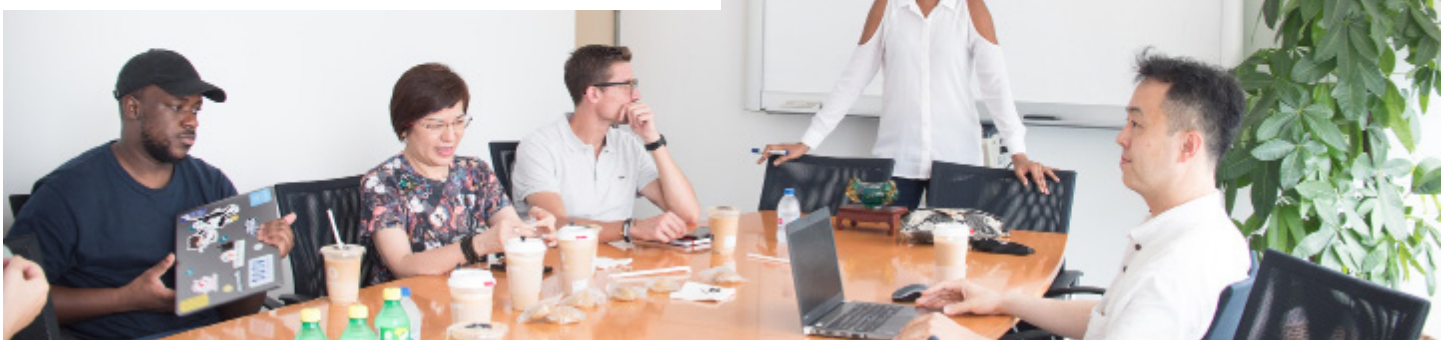
First meeting of the Youth Service Committee 2020-2021

The Rotary Club of Shanghai recognizes these merits and strives to create better connections between Rotarians and our Youth Clubs. We love to hear from our clubs and keep abreast of their progress. Unfortunately, Covid19 led to the cancellation of our annual Interact night dinner. The loss of this event profoundly saddens us. However, the wonders of modern technology and media allow our Interactors can still share the ups and downs of their past year.